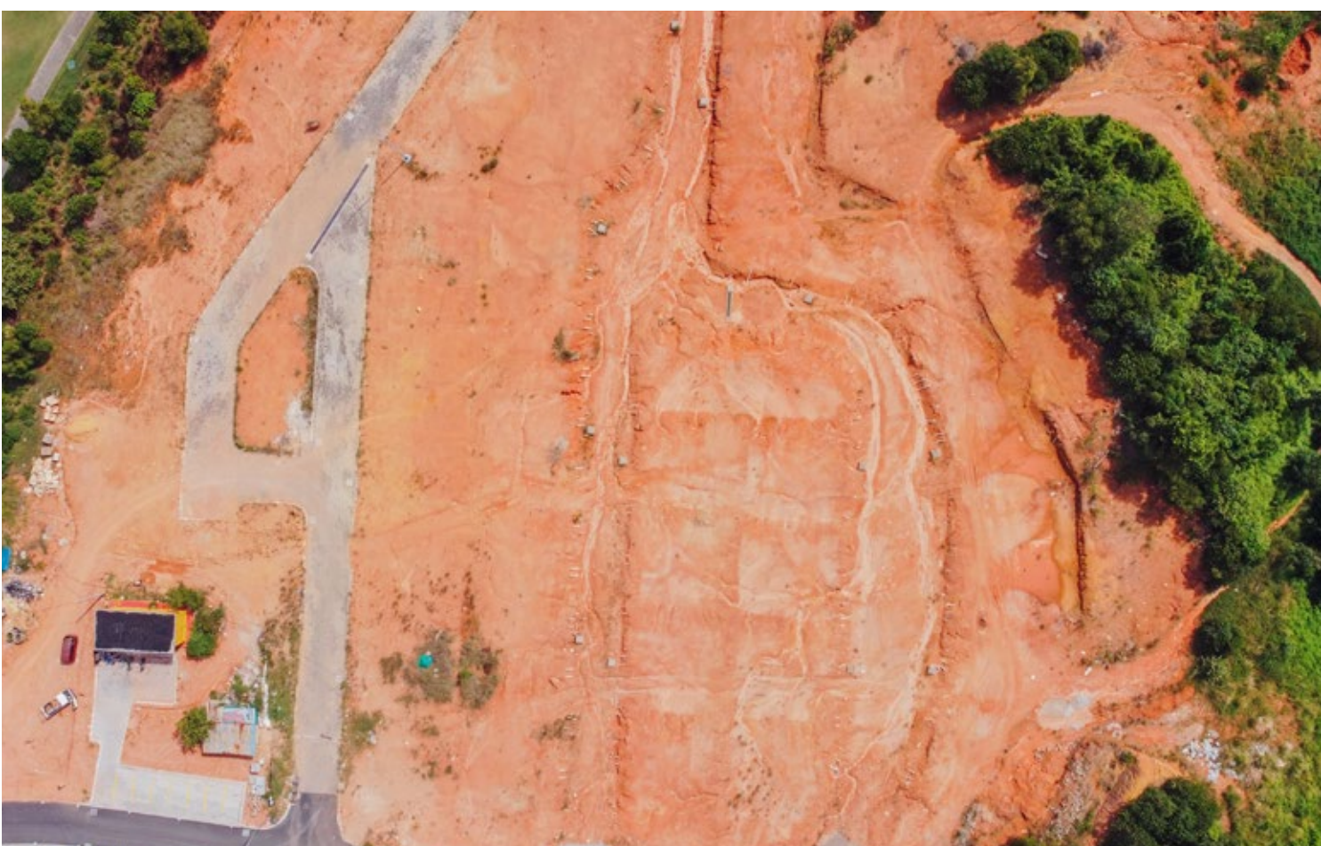
Construction of Landed House phase 2

The construction of the Infinity Pool @ Kalani Tower has now reached 70%, currently the pattern concrete installation is underway.