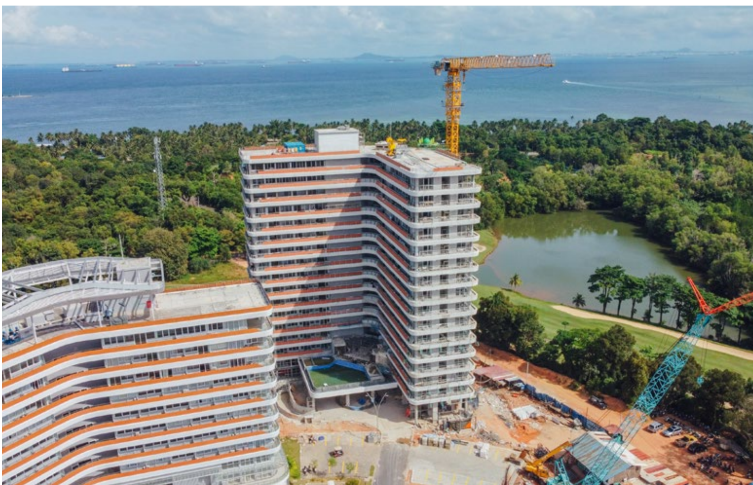
Kalani Tower Construction, The Nove

Persentase progres pekerjaan struktur dan arsitektur Apartemen Kalani telah mencapai 94%. Pekerjaan arsitektur saat ini sedang dalam proses pengecatan dinding. Sedangkan pekerjaan facade yang meliputi pekerjaan pemasangan railing area balkon, sera wood dan ACP saat ini telah mencapai progress 78%. Progres instalasi pintu dan jendela alumunium telah mencapai 85%, dilanjutkan dengan proses pemasangan kusen, rangka plafond untuk area unit dan koridor.