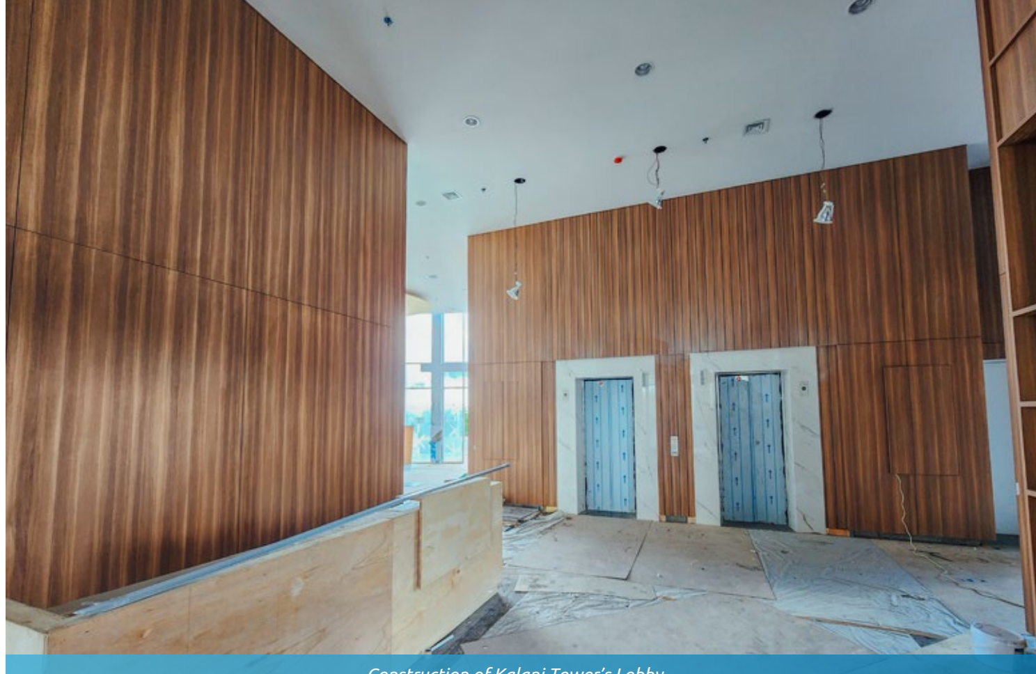
Construction of Kalani Tower's Lobby

The Kalani Apartment is equipped with an infinity pool facility which has entered the gutter and stainless grill work, the progress has reached 93.89%.