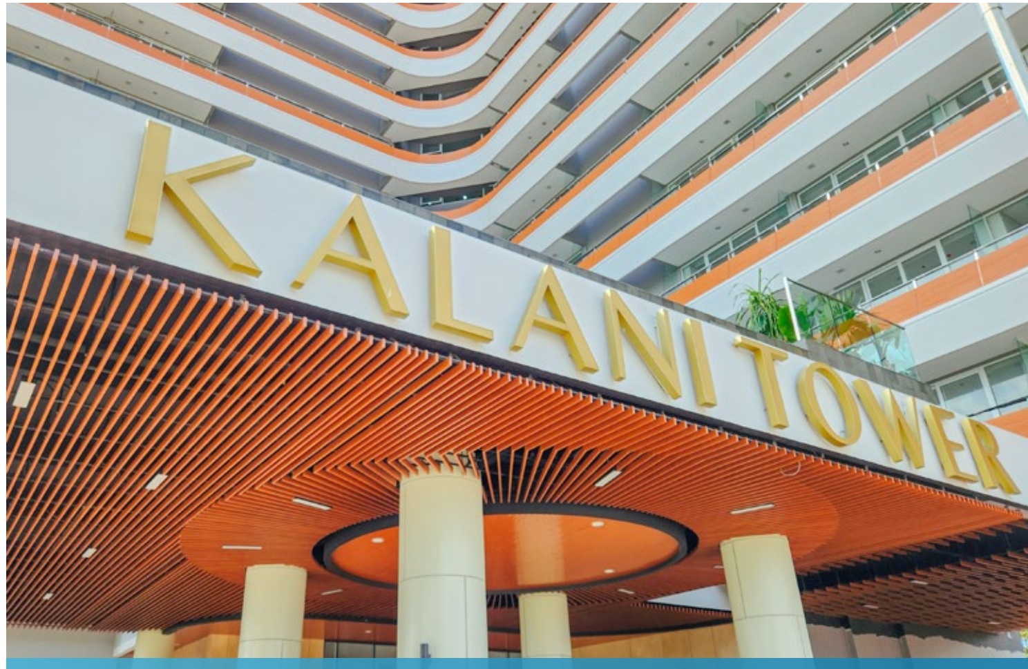
Kalani Tower Construction, The Nove

Nuvasa Bay memiliki area residensial bernama The Nove dengan produk unggulannya yakni apartemen Kalani. Progres pembangunan apartemen Kalani sudah memasuki finishing stage yang telah mencapai 99,69%, dimana pekerjaan arsitektur memasuki tahap pengecatan, pembersihan unit dan perbaikan defect . Selanjutnya, pekerjaan fasad telah memasuki proses checklist yang telah mencapai 99,92%. Apartemen Kalani juga telah memasuki tahap konstruksi instalasi pintu dan jendela aluminium yang telah mencapai 99,81%.