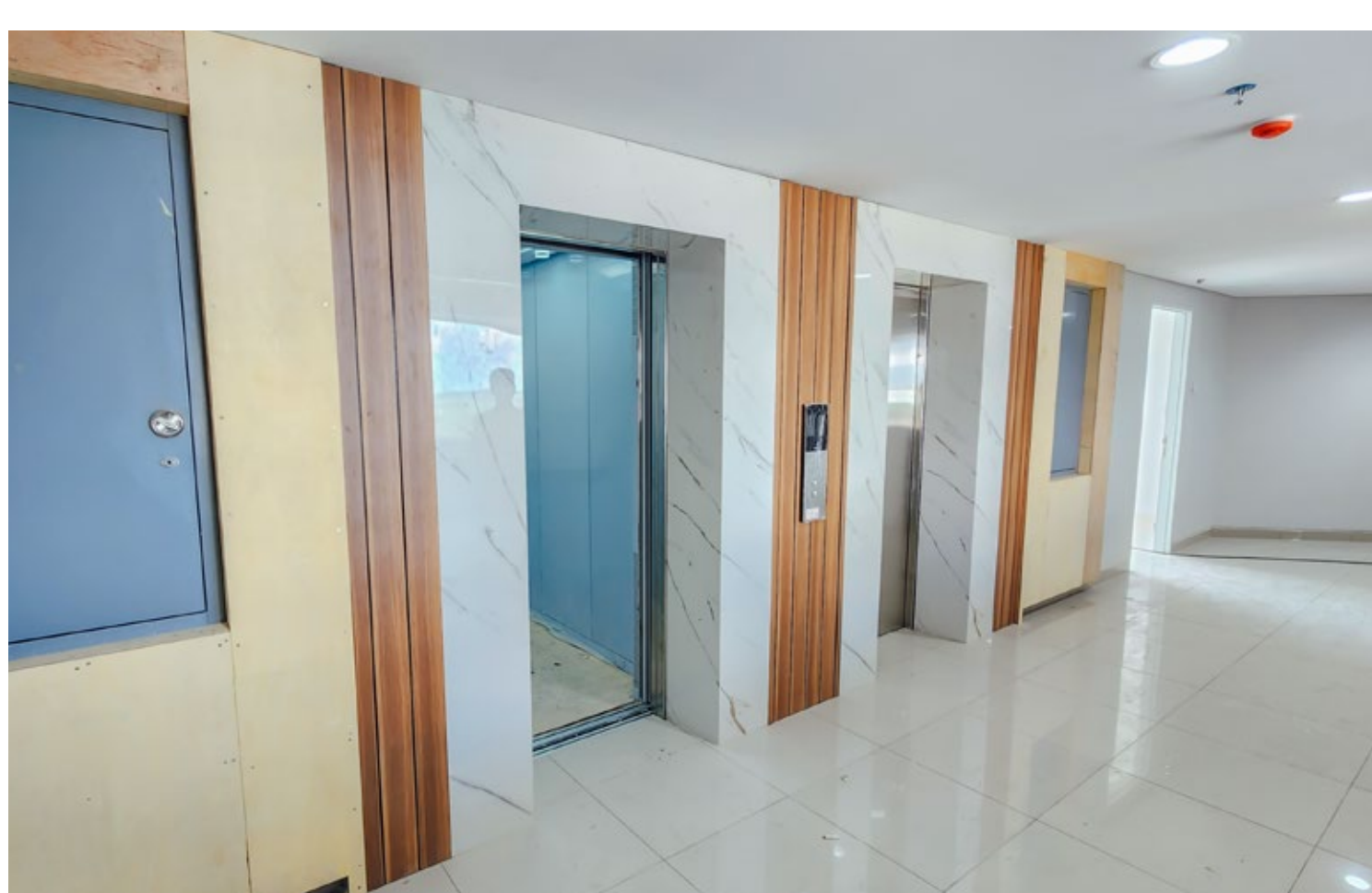
Passenger Elevator @ Kalani Tower

Construction of the Sky Garden is on the Bengkirai Deck painting .